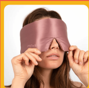
branded sleep masks Drowsy Sleep Co. Min. quantity: 100 Lead time: 4 weeks