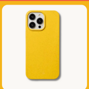
branded phone case Wavecase Min. quantity: 150 Lead time: 3-4 weeks