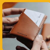
Branded wallets WingBack Min. quantity: Variable Lead time: Variable