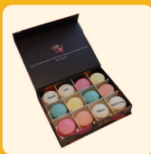
Branded macarons Mademoiselle Macaron Min. quantity: No minimum Lead time: Variable