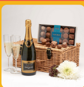
Branded hampers & food The Gifting Team Min. quantity: 100 for boxes Lead time: 3-4 weeks