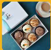
Branded cupcakes Rachael's Kitchen Min. quantity: Variable Lead time: Variable