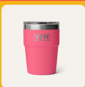
branded insulated cup YETI Min. quantity: 54 Lead time: Variable