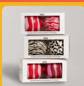
Branded chocolate-filled baubles G&A Gifting Min. quantity: Variable Lead time: Variable