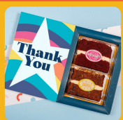
Branded cake cards & boxes Sponge Cake Min. quantity: 100 Lead time: Variable