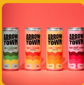
Branded vodka soda cans Arrowtown Min. quantity: 50 Lead time: Variable